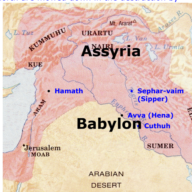
Figure 21: Babylonian Populated Cities that King Esarhaddon of Assyria relocated to the Northern Kingdom

Esarhaddon does not move Assyrian nationals to the region; rather, he moves Assyrian subservient Sumers or Babylonians of his empire into the Promised Land from Cuthuh, Avva (Hena), Hamath and Sephar-vaim (Sippar). The newly planted Sumers or Babylonians settle in the old Northern Kingdom and intermarry with the Jews left behind and begin to call themselves Samaritans. They are strong, much stronger than the Jews killed by the Assyrians. Throughout Scripture, the word cedar is used figuratively to allude to the strong conquerors of Assyria ,