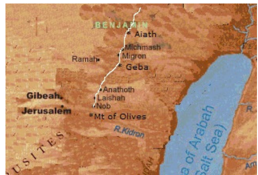
Figure 22: Prophecy of the Assyrian March to Nob by Sennacherib in 712 BC

Isaiah 10:28 He has come against Aiath, He has passed through Migron; at Michmash he deposited his baggage. 29 They have gone through the pass, saying , "Geba will be our lodging place." Ramah is terrified, and Gibeah of Saul has fled away. 30 Cry aloud with your voice, O daughter of Gallim! Pay attention, Laishah and wretched Anathoth! 31 Madmenah has fled. The inhabitants of Gebim have sought refuge. 32 Yet today he will halt at Nob; He shakes his fist at the mountain of the