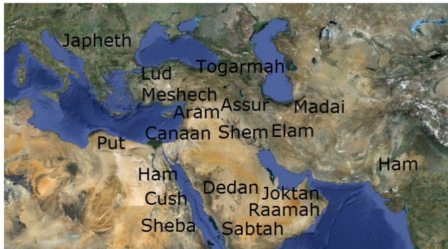
Map 10: Division of Families by Languages after the Tower of Babel

Vision 7 addresses the Babylonian Empire that will not be established for a minimum of another 114 years. However, the Babylonian civilization began in earnest within 98 years after Noah and the flood. Noah and his children moved down the mountains of Ararat and established several settlements, including the location of Nineveh. As the family grew, Nimrod, Noah's grandson, took the lead and moved the family down the river to establish the settlement known as Babylon. It is a direct violation of the Lord's instruction to spread and populate the earth. Just 98 years after the flood, Nimrod leads the relatives to build a tower to heaven as a monument to their own greatness. The tower displeases the Lord. He confounds their languages and forces them to seek new homes in the world. The family units move to the different locations identified in Map 7. At the time of the tower construction, the Scripture records the names of 61 males, of whom 18 are the family heads who relocate across the vast region of the Middle East and beyond. Therefore, all the nations of the world began in the Babylonian