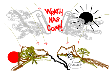
Figure 49: Sky rolls up like a scroll

because "the sky will be rolled up like a scroll." This simile is used again in the Book of Revelation which details the culmination of this vision.