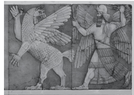
Picture 14: Marduk with thunderbolts pursuing Anzu who stole the Tablets of Destiny

Isaiah 45:9 "Woe to the one who quarrels with his Maker-- An earthenware vessel among the vessels of earth! Will the clay say to the potter, 'What are you doing?' Or the thing you are making say, 'He has no hands'? 10 "Woe to him who says to a father, 'What are you begetting?' Or to a woman, 'To what are you giving birth?'" 11 Thus says the LORD, the Holy One of Israel, and his Maker: " Ask Me about the things to come concerning My sons, And you shall commit to Me the work of My hands.