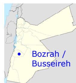
Map 27: Bozrah in Edom

In Isaiah, the Lord is glowing in the colors of Bozrah, which in Hebrew means tribulation or distress, as he comes from Edom. The Lord will not be in tribulation or distress, He will be stained in the colors of the judgment He has enforced on Edom. Bozrah is the city of Jobab, named after one of the early Edomite kings. 97 It is also mentioned by the prophets in Jer 49:13, Amos 1:12 and Mic 2:12. Its modern city is el-Busseireh, which lies in the mountain district of Petra, 20 miles southeast of the Dead Sea.